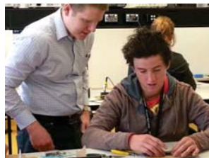
World-class facilities and resources