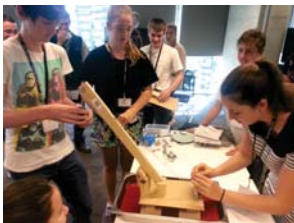
Work in groups solving hands-on engineering problems

Visit www.telg.com.au/register for more information