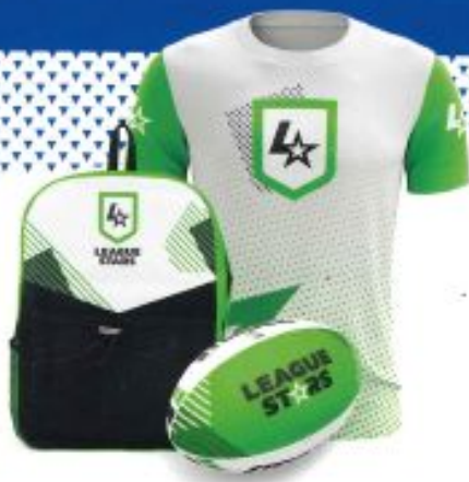
Photo items may differ from actual items