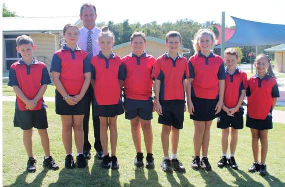
Semester 1 School Captains