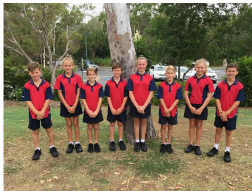
2018 Sports Captains